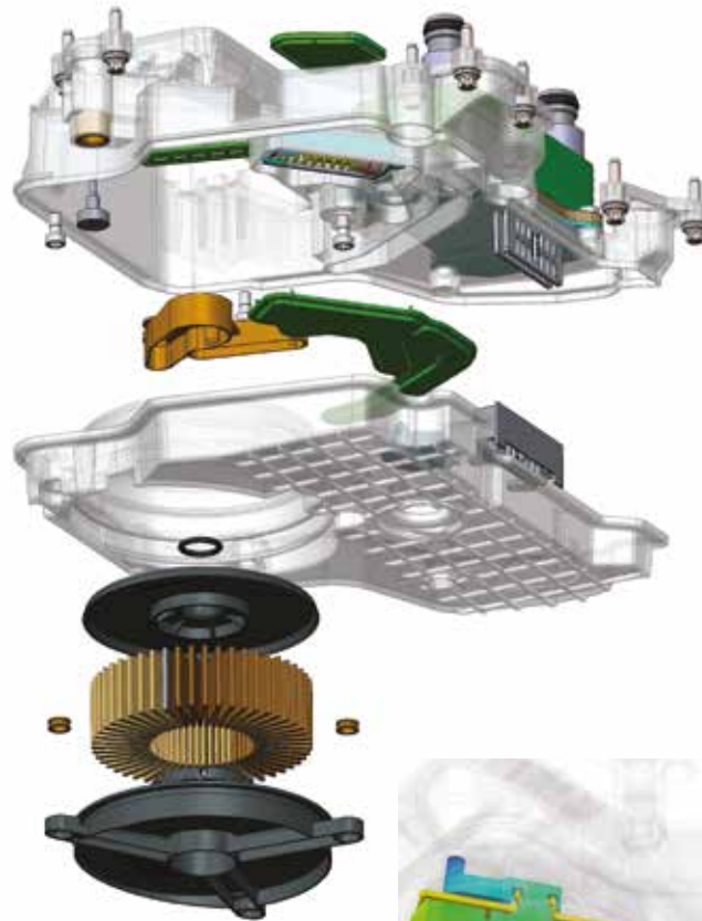
Module with filter, heat exchanger and oil pump for electrified drivetrains

Beside the oil contamination caused by wear, the clutches pollute the oil, mainly with metallic and non-metallic particles. If the amount and size of the particles is not reduced, this can result in a shortened lifetime of the electrical motor when the oil is used for its cooling. Because of these changes in the basic gearbox architecture, Filtran has focused on the development of more efficient filter material. This means that