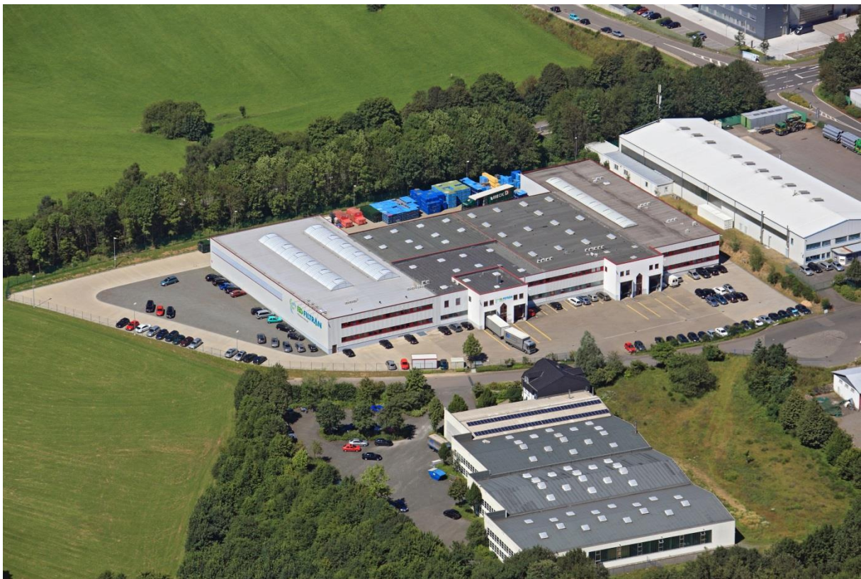
Illus. 1: IBS FILTRAN GmbH company site

The present Supply Chain Manual helps to standardize the supply relationships between the respective SUPPLIER and IBS FILTRAN, in order to ensure a smooth collaboration as well as to establish a common understanding of the logistics process.