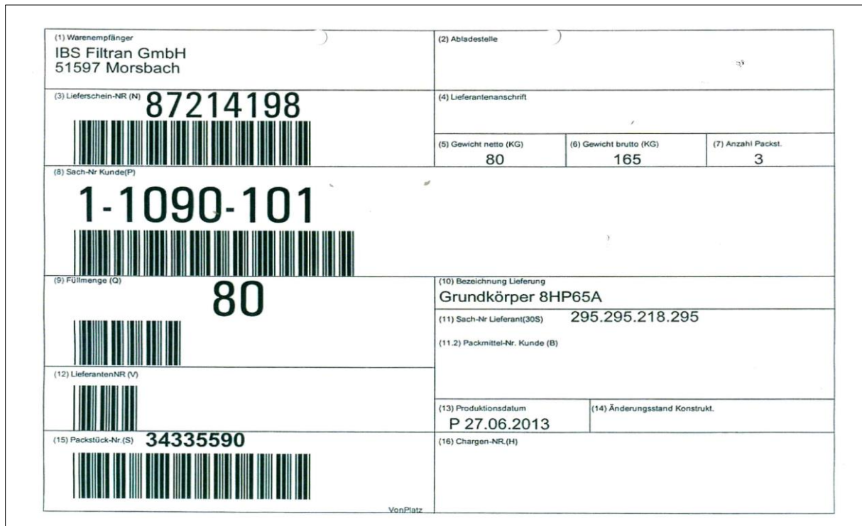
Illus. 3: Barcode label under VDA 4902

The label must be attached in a clearly visible position. From the label, part description and part number must be clearly recognizable. The label must be attached to the front side on the upper left corner. All information on the VDA label as well as the barcode itself must be readable and must not be covered by safety straps.